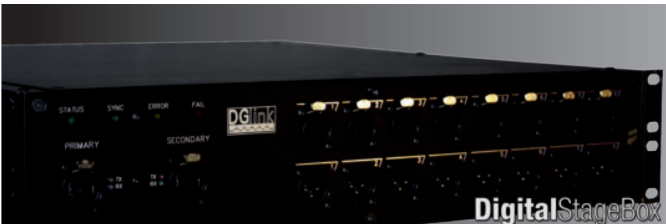
Digital Stage Box