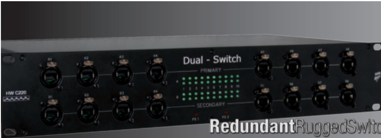
Redundant Rugged Switches

DGlink media switches and stage boxes were designed to meet the dynamic digital audio, lighting, and video transport requirements for live events and on site broadcast applications.