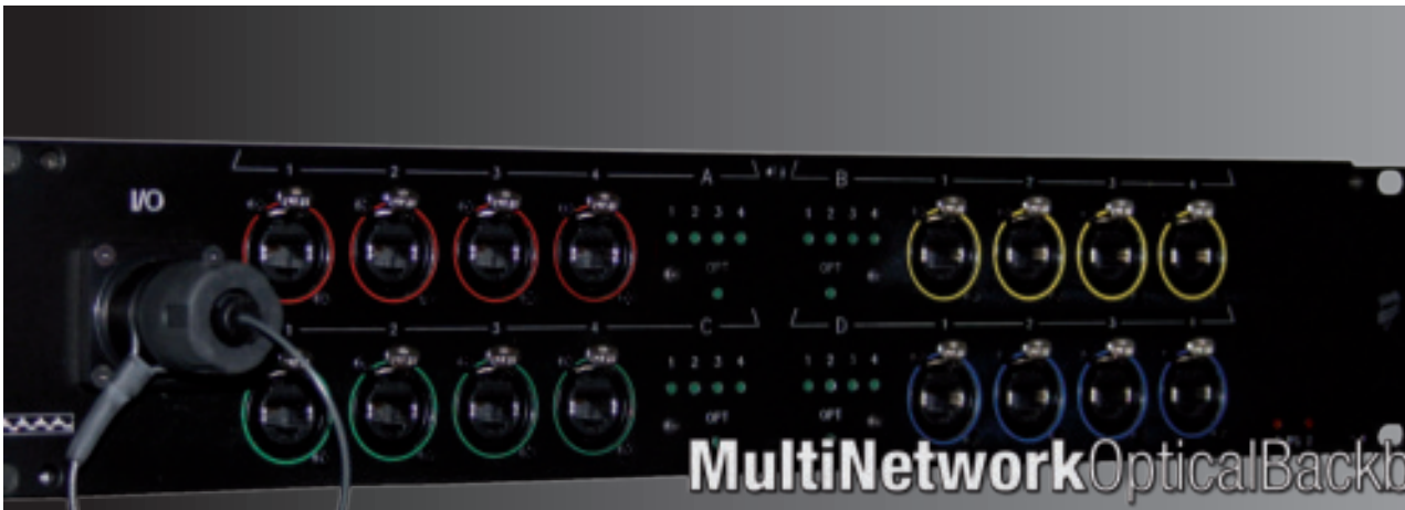
MultiNetwork Optical Backbone