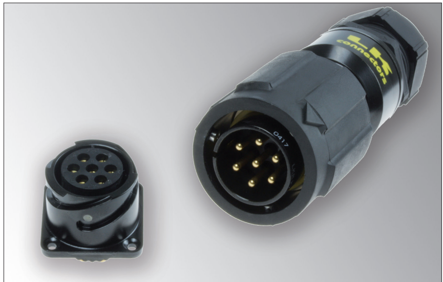
LKR P7: M32 plastic spring skin top as standard for cable connectors.