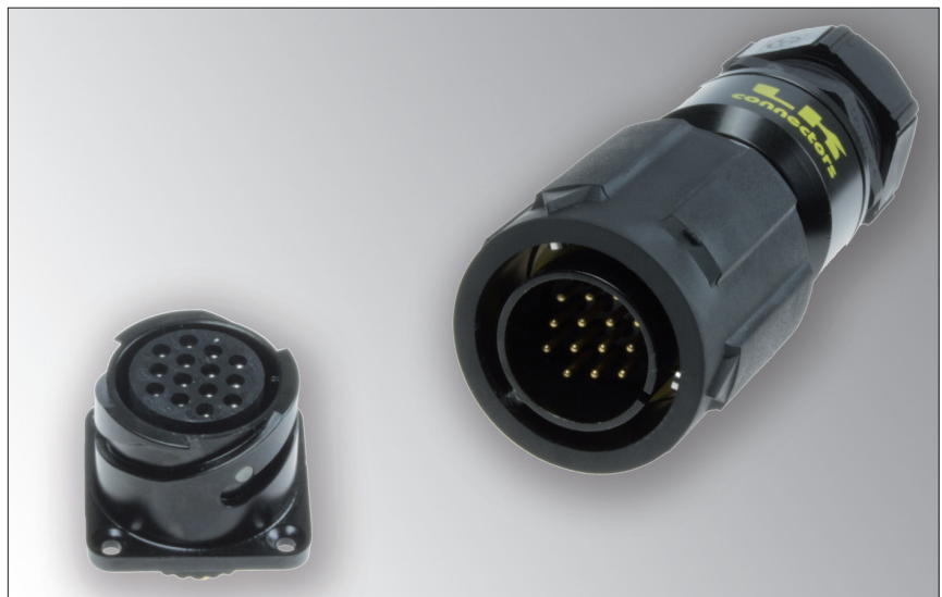
LKR P14: M32 plastic spring skin top as standard for cable connectors.