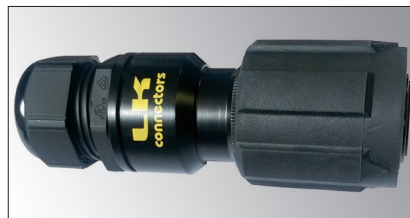
Rubber locking ring available